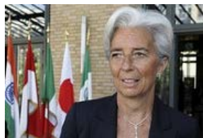
IMF chief urges action to