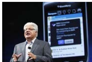
Research In Motion co-

U.S. stock futures trade slightly higher on Monday as investors